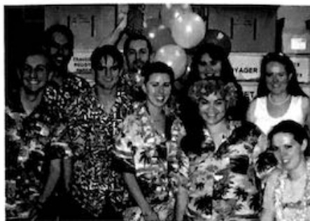
Dressing down: Staff from Concorde International

The 520 organisations across Victoria who chose to wear casual clothes or fancy dress to work on Friday 27 November and joined the inaugural Dress Down Day. Many people put in a great deal of effort and participated in Pyjama Parties, Formal Wear, School Uniforms, 70s Celebrities and Cross Dressers themes. It raised $34,000.